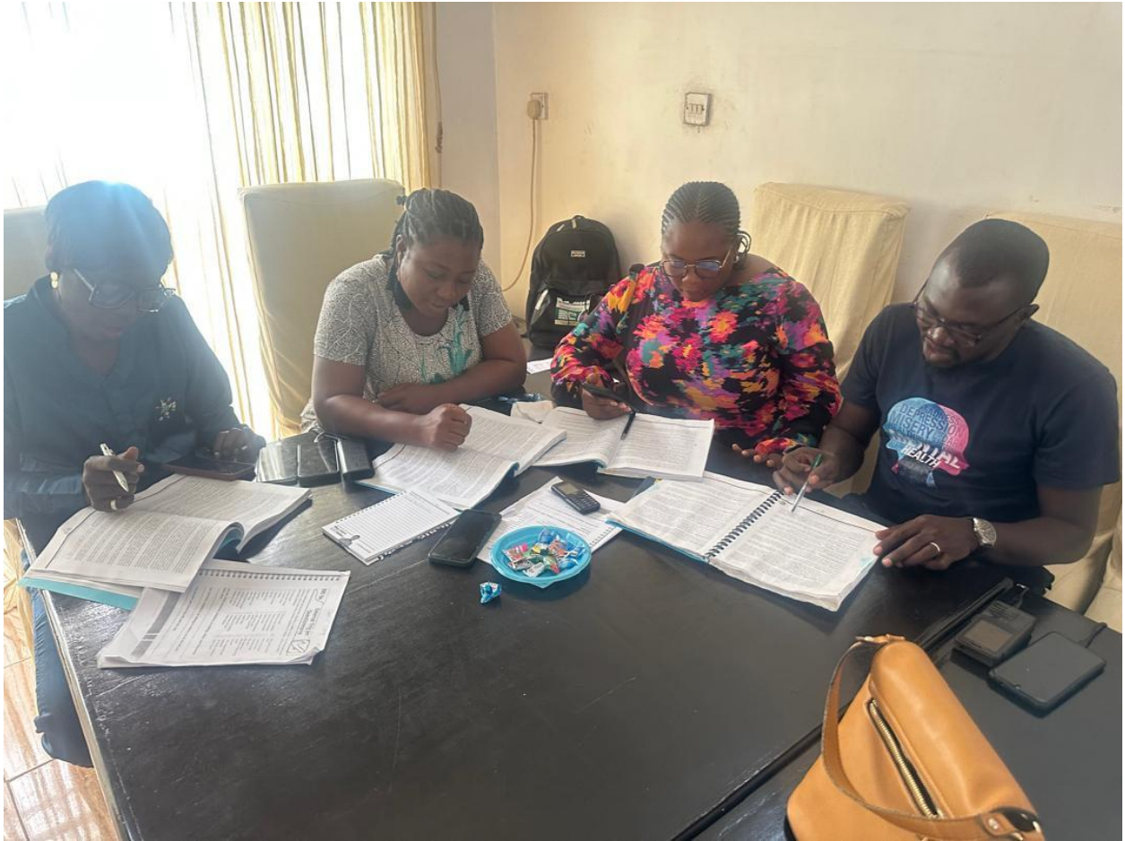
Group discussion for presentation there after