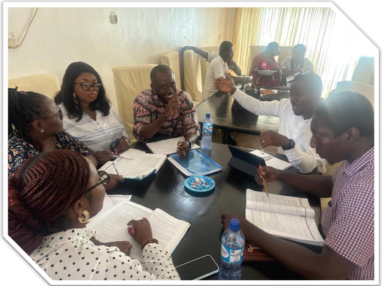
Group work presentation