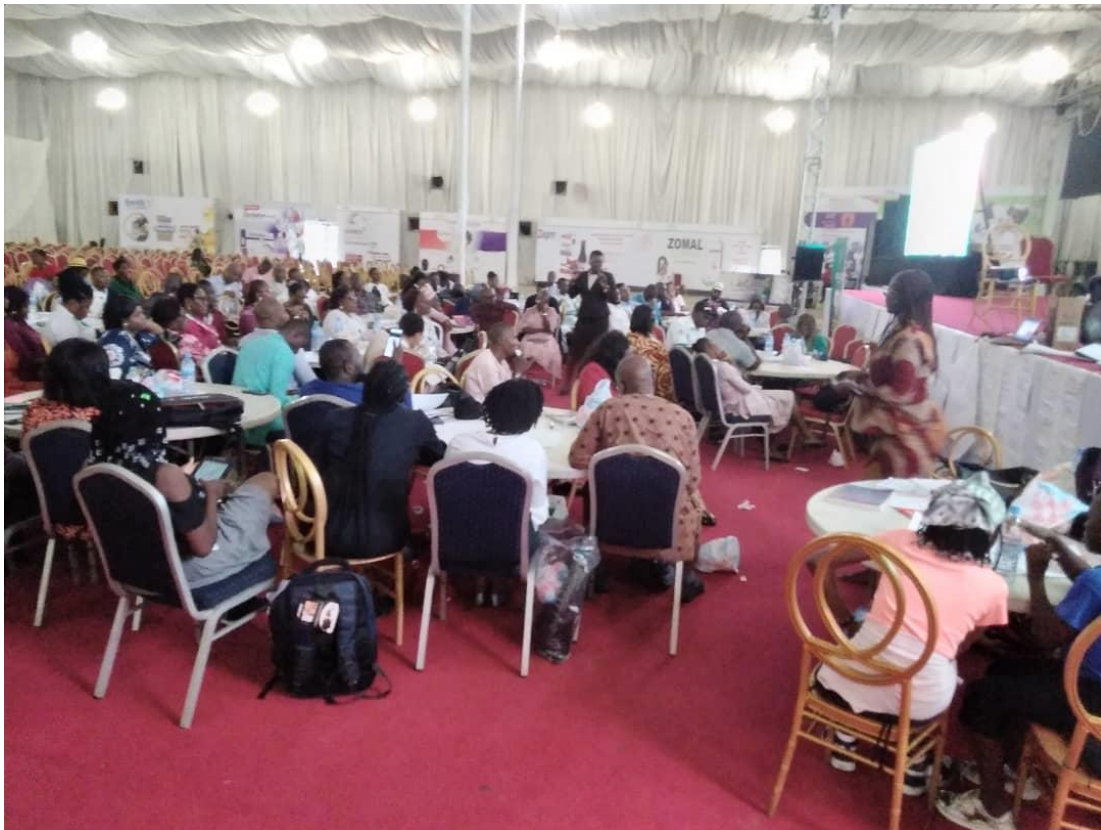
The Dome Event Centre, venue of the 42 nd Annual National Scientific conference of ACPN was first used to assemble registered participants on arrival before moving to Troscana Hotel for subsequent training sessions.

To get this impressive number of 95, the Association leverage on few factors such as conducting the training during our Annual National conference where at least a thousand Community Pharmacists would gather; making the training also attract Pharmacists Council of Nigeria's Mandatory Continuous Professional Development Points and by reducing the cost of training by over 50% of conventional rates.