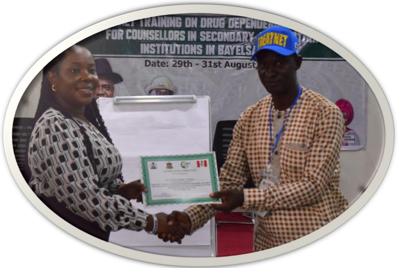
Participant receiving certificate of participation presented by the Chairman of BADAPARC