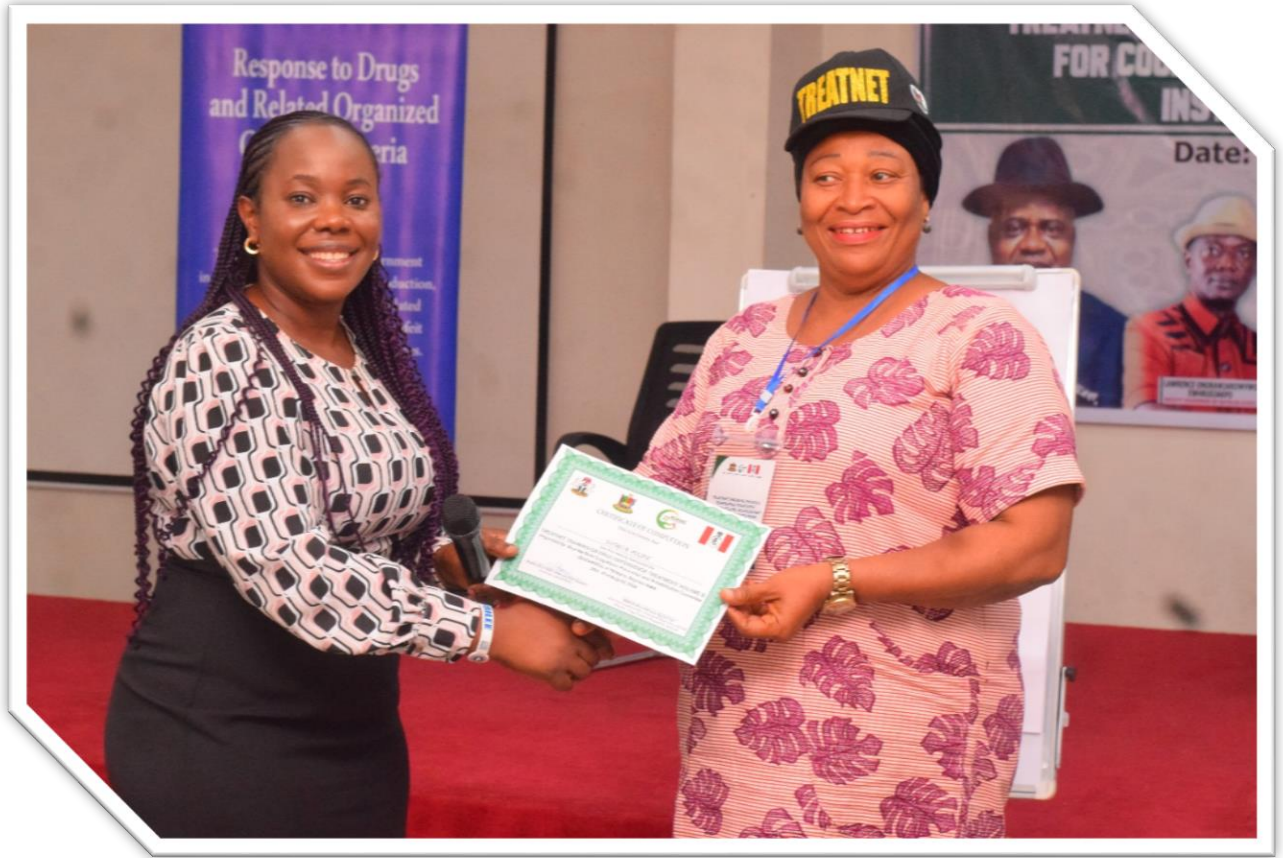
Participant receiving certificate of participation