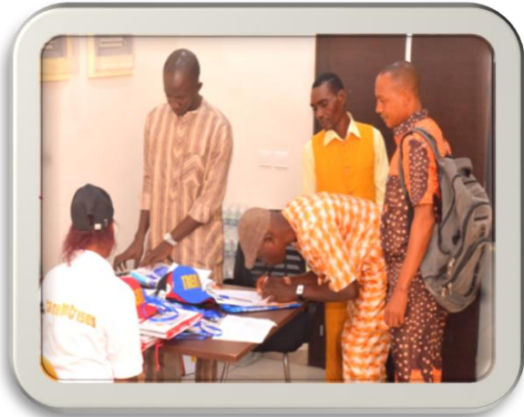
Participants queued-up registering and collecting training materials.