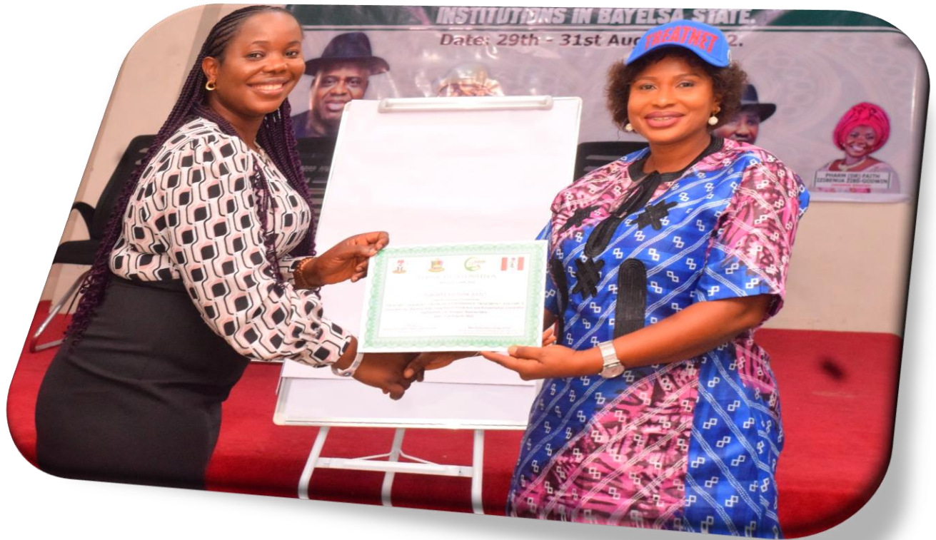
Participant receiving certificate of participation