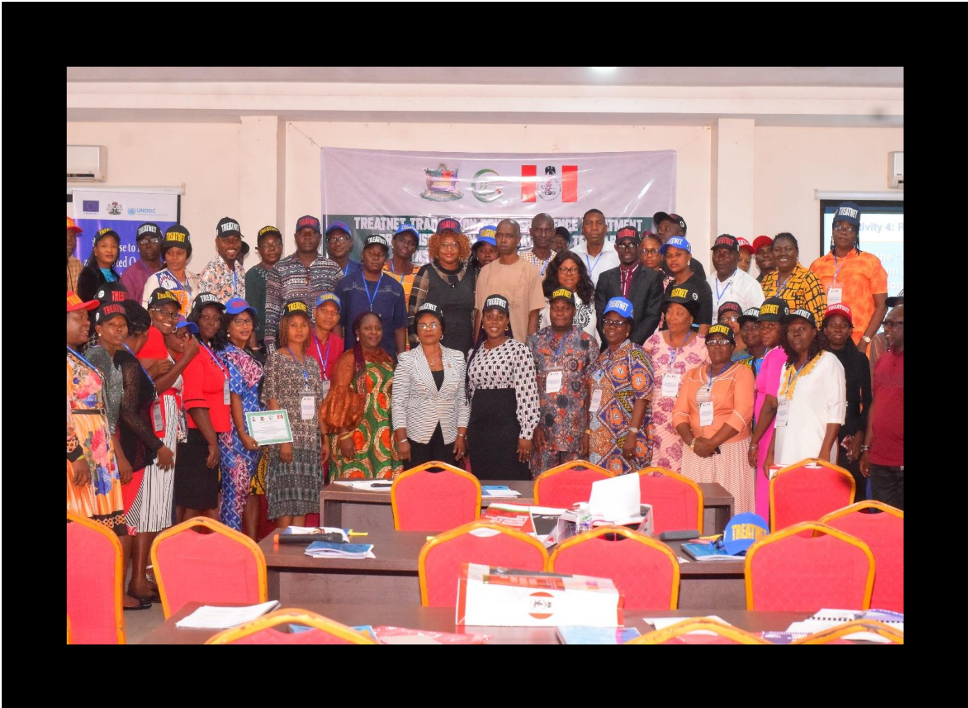
Group photograph above with the Committee chair and facilitators at the end of the training