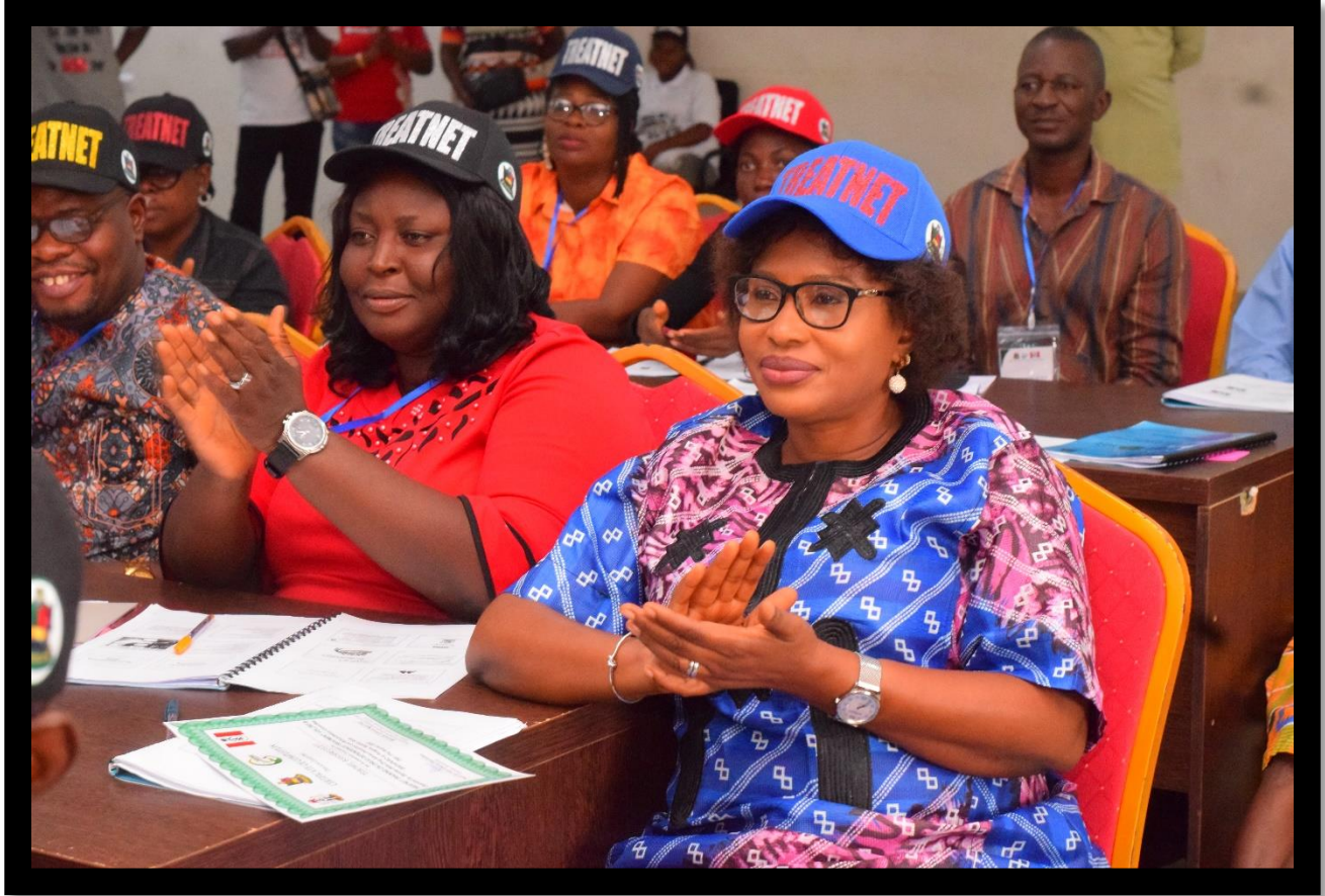
Participants above applauding the training experience