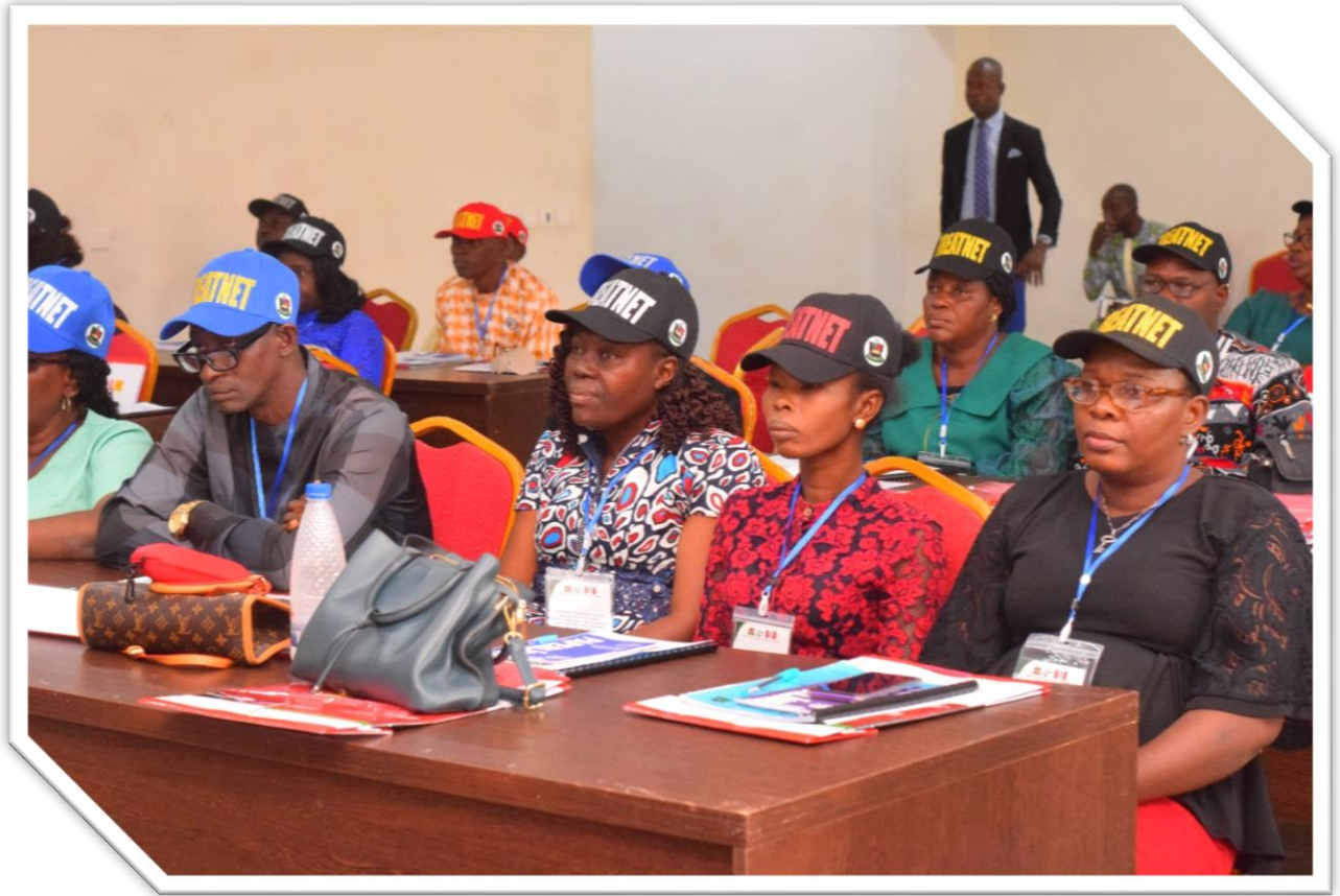
Picture of participants sternly looking at the screen during a training session.