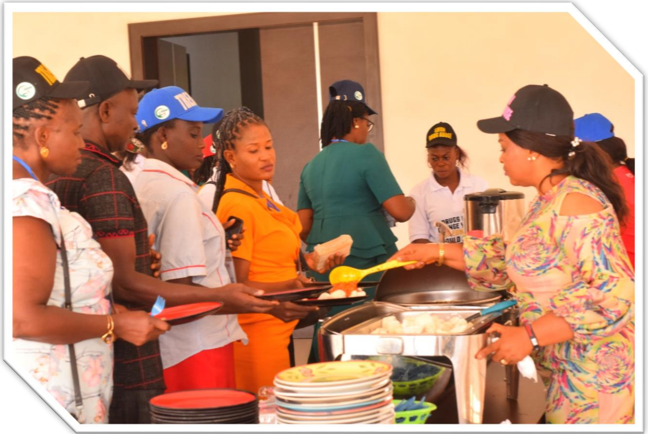
Participants here on queue during the tea-break.