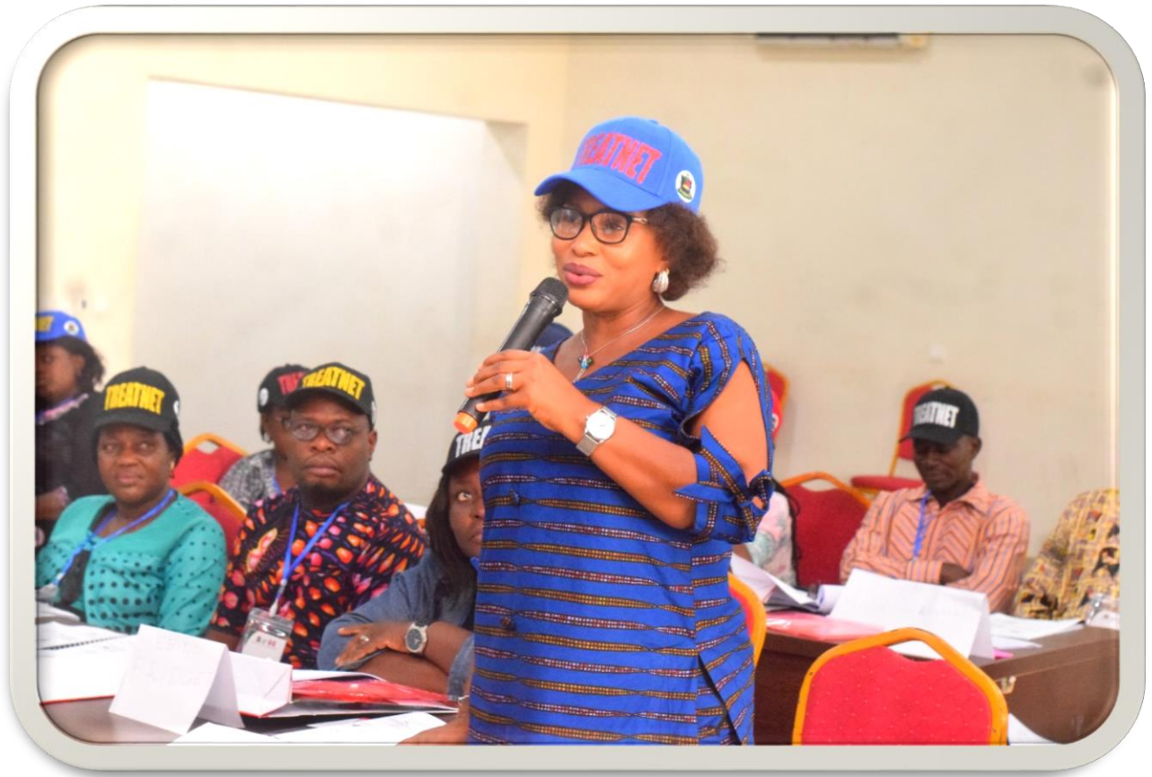
A participant above asking question