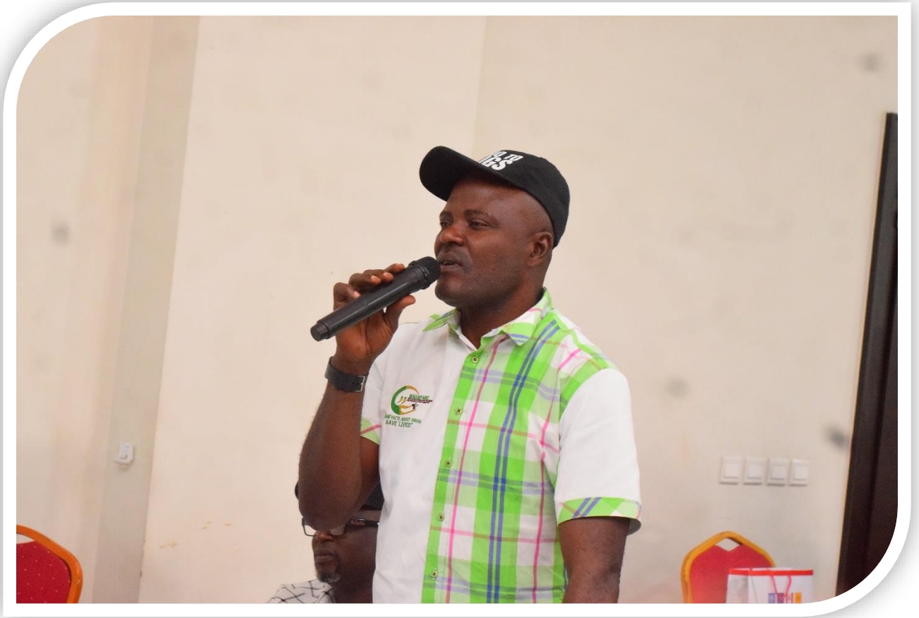
A participant above responding to question.