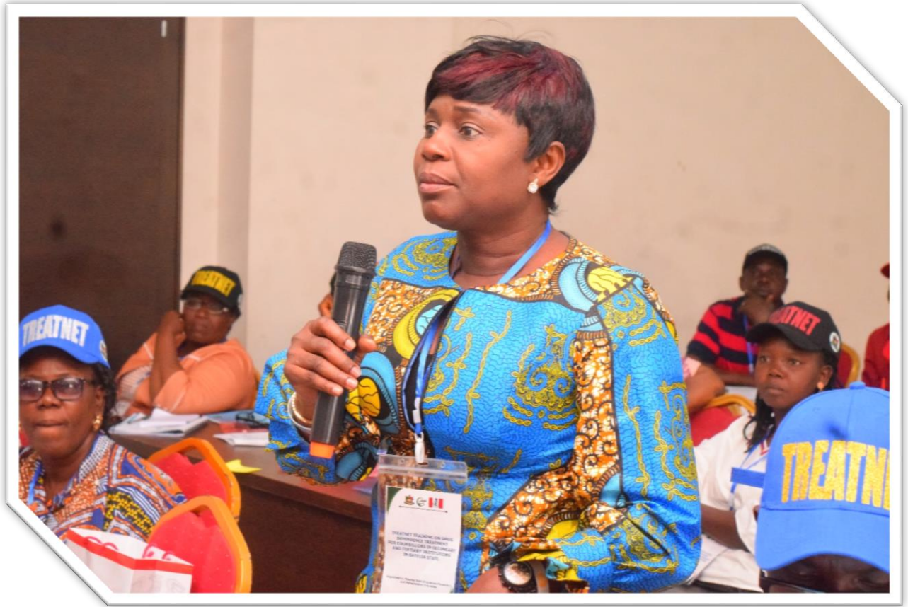
A participant above sharing her experience