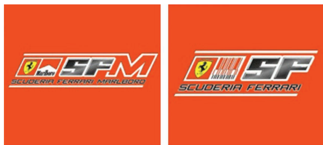
Figure 2 Ferrari F1 team names and logos, 2007 and 2010.

livery. This was to promote Philip Morris' new Marlboro Lights brand of cigarettes. The colour did not work on television and the experiment was never repeated. 33