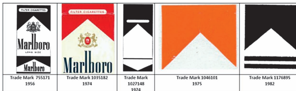
Figure 3 A selection of Philip Morris trademarks registered in the UK 1956–82.

voluntary agreements on the sponsorship of sport by tobacco companies with various governments, which, as far as F1 is concerned, started in Germany in 1976. 51 In the UK, for example, the fourth such voluntary agreement in 1995, 'placed restrictions relating to the display of [tobacco] sponsor's signs, the use of brand names or symbols at televised events' and did not permit 'the display of house or brand names or symbols on participants and officials, their vehicles and/or animals likely to come within the scope of the television cameras'. Participants were defined to include 'auxiliary personnel and mechanics'. 52