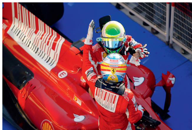
Figure 7 Marlboro 'barcodes' on both the Ferrari race car and the driver's clothing in early 2010.

techniques known as 'trademark diversification' and 'alibi marketing'. 61 Trademark diversification involves the use of a cigarette brand name on the branding of other and typically unrelated products, such as clothing. 62 Alibi marketing involves distilling a brand identity into its key components, such as the distinctive red and white colouring associated with the Marlboro brand, or the shade of purple used by Silk Cut, and using these to promote the brand in place of a conventional logo or trademark. 63 This study was carried out to assess the validity of Ferrari's assertion that barcode design displayed on their F1