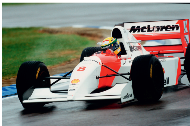
Figure 4 Substitution of Marlboro with McLaren on a McLaren F1 car in 1993.

occasionally even during the season. Furthermore, if it was a case of advertising branding, Philip Morris would have to own a legal copyright on it'. 59 An article on a motorsport website ( http://www.autosport.com/ ) quoted from a Scuderia Ferrari Marlboro press release, which said that criticism was 'based on two suppositions: that part of the graphics featured on the Formula 1 cars are reminiscent of the Marlboro logo and even that the red colour which is a traditional feature of our cars is a form of tobacco publicity...neither of these arguments have any scientific basis, as they rely on some alleged studies which have never been published in academic journals. But more importantly, they do not correspond to the truth'. 60