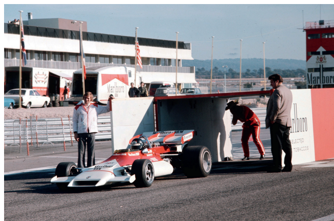
Figure 1 Marlboro branded BRM F1 car emerging from a mock-up of a giant Marlboro cigarette pack in 1972.

The Ferrari F1 team traditionally races in Italy's historic national motor racing colour, red. Philip Morris documents reveal that the company has long recognised the importance of association with Ferrari, and the red colour schemes shared by Ferrari and the Marlboro brand. Only once in F1 has Marlboro made use of a colour other than red, at the 1986 Portuguese F1 Grand Prix, when McLaren ran one car in a gold and white