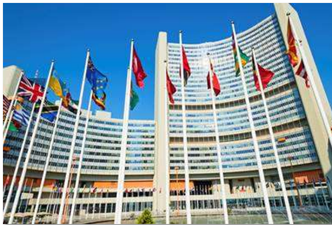
The Vienna International Center in Austria: Headquarters of the UNODC, INCB, and Commission on Narcotic Drugs