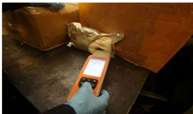
A U.S. Customs and Border Protection officer uses a Raman laser device to determine the contents of a package suspected of containing an illegal drug at the JFK airport mail inspection site.