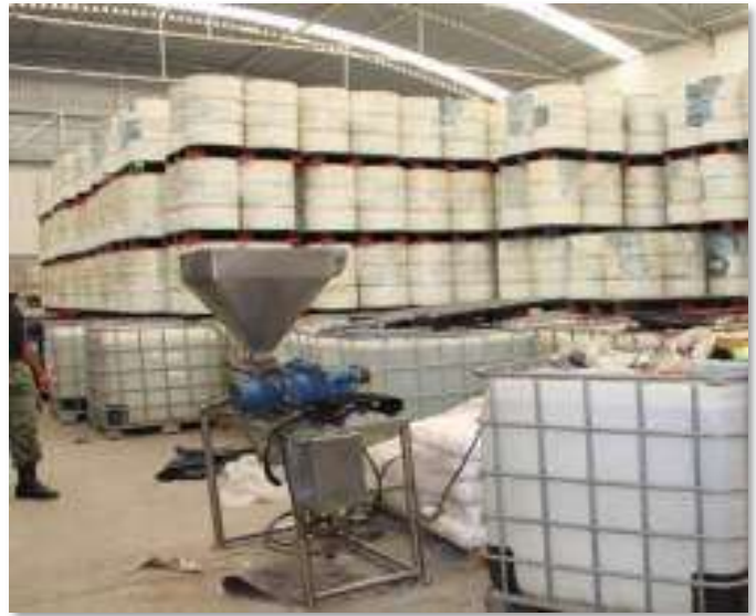
Precursor chemicals seized by Mexican authorities.